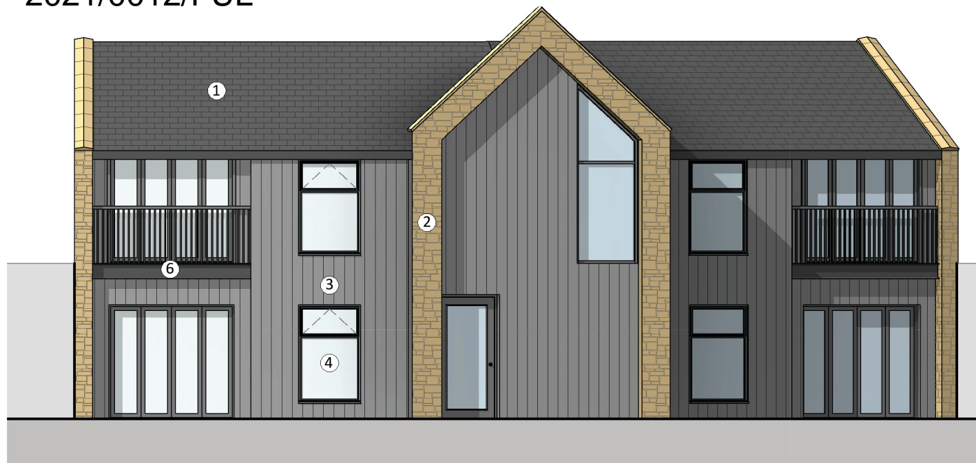
1. South Elevation SCALE - 1 : 100@A3