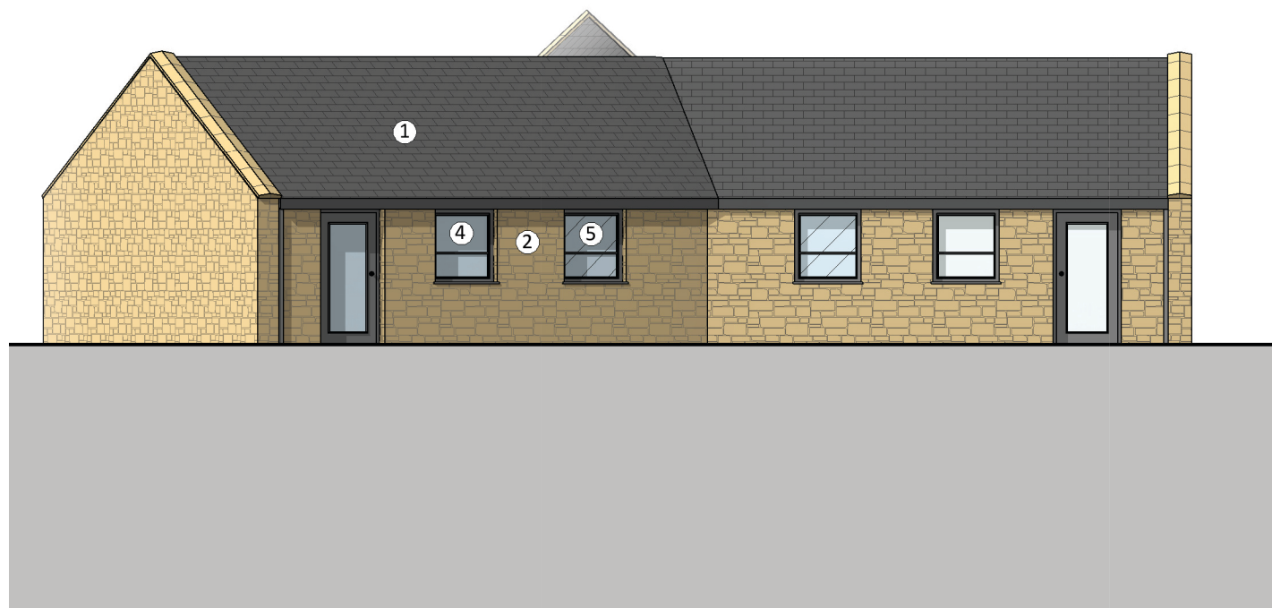
3. North Elevation SCALE - 1 : 100@A3