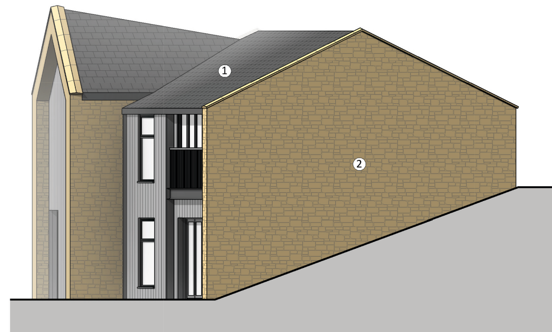
4. West Elevation SCALE - 1 : 100@A3